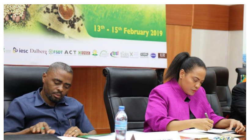
5th AAPC Highlight: Hon. Angellah Kairuk, Minister of State in Prime Minister's Office (Investment) (right) listening on to discussions during the 5th AAPC before officiating the opening of the 5th AAPC. On her left is the Deputy Minister of Agriculture, Omary Tebweta (MP).